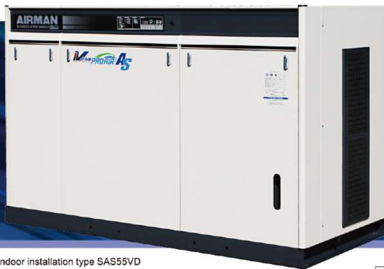
Indoor installation type SAS55VD